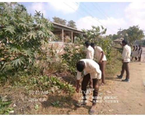
N.S.S Special Camp in the village Mudunuru