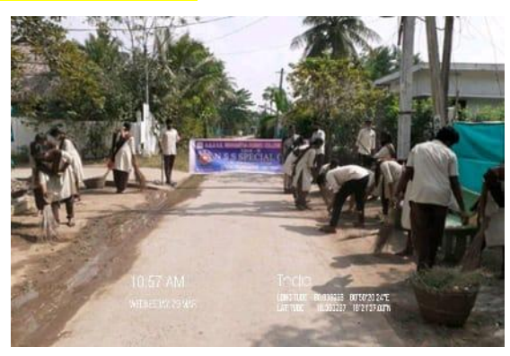
N.S.S Special Camp in the village VallliruPallem

N.S.S Special Camp has been organized in the nearby village VallliruPallem on 10-03-2019. Volunteers of N.S.S units – I & II rendered their services in the village VallliruPallem , arranged awareness camps on Clean and green to roads and drinageses and 45 NSS volunteers are participated.