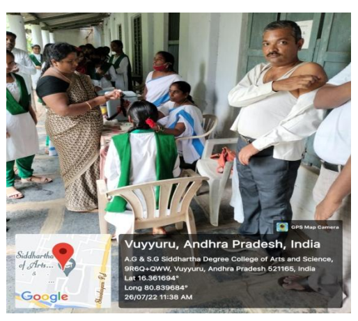
COVID-19 Vaccination Programme

N.S.S Unit I & II has been organized COVID-19 Vaccination Drivein the junior College Campus to the faculty and students on 26-07-2022. 38 NSS volunteers are participated.