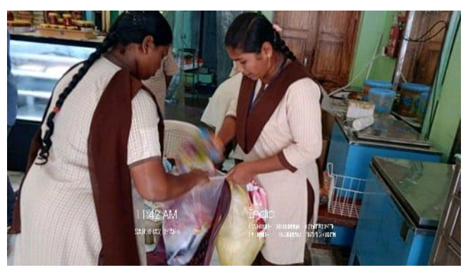
To Avoided Plastic Materials in Vuyyuru Market